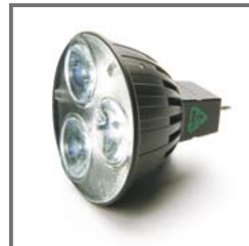
MR16 TRIPLE LED