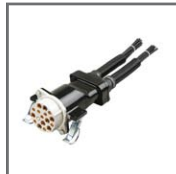
MODULE 42 DOUBLE CONDUIT