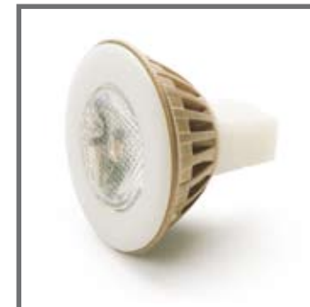
MR16 SINGLE LED