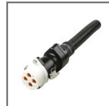
MODULE 32 JUMPER PLUG